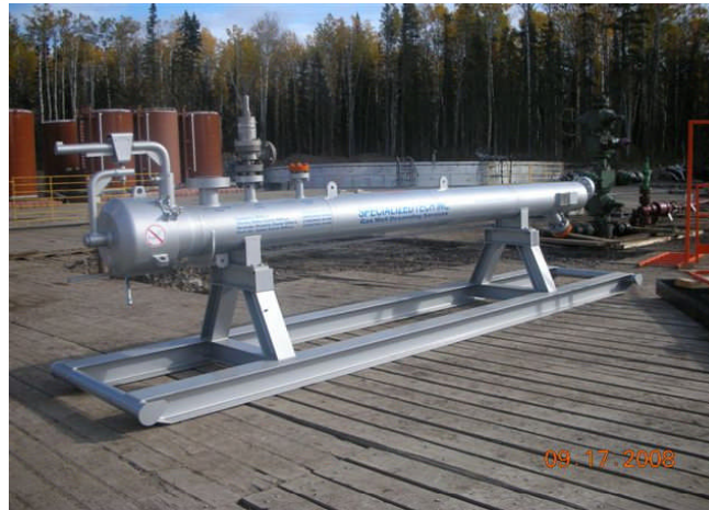
Model 61416 L3FA