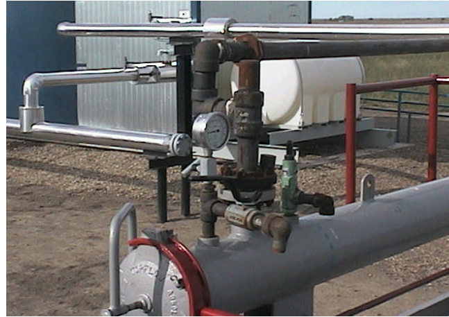
Model 2810 S2TR