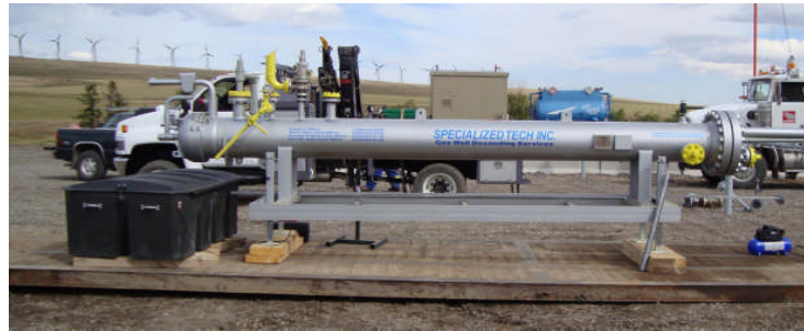
Model 21615 L4FA